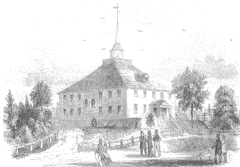
THE OLDEST MEETING-HOUSE IN THE UNITED STATES, AT HINGHAM, MASSACHUSETTS