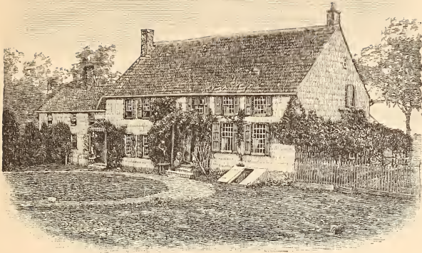
“ The Old House ” at Cowneck.