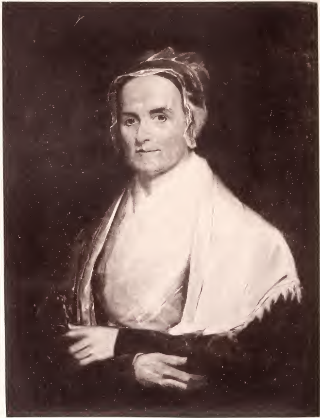
FORBES CO, ALBERTYPE.