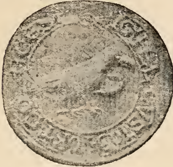
The Raven Seal.

is supposed to have been the seal of the Portreeve used before the incorporation of the