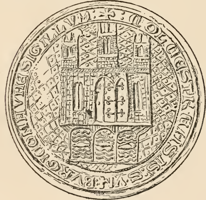
Reverse.—"The Castle Side."