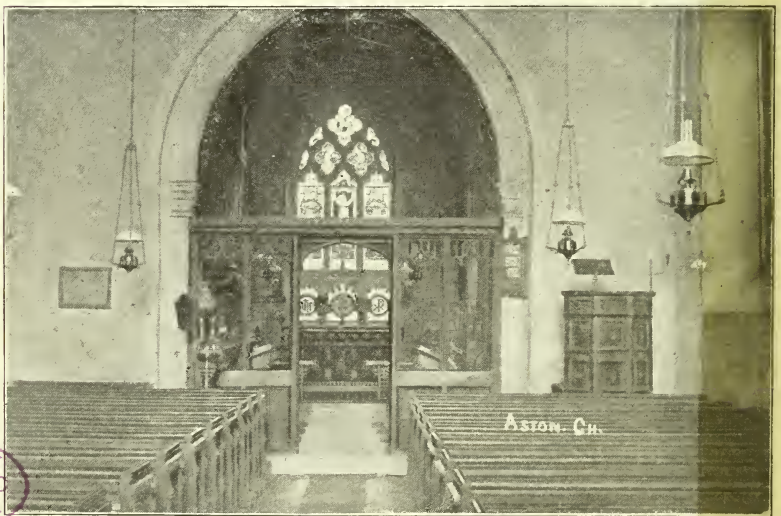
INTERIOR OF THE ASTON CHURCH