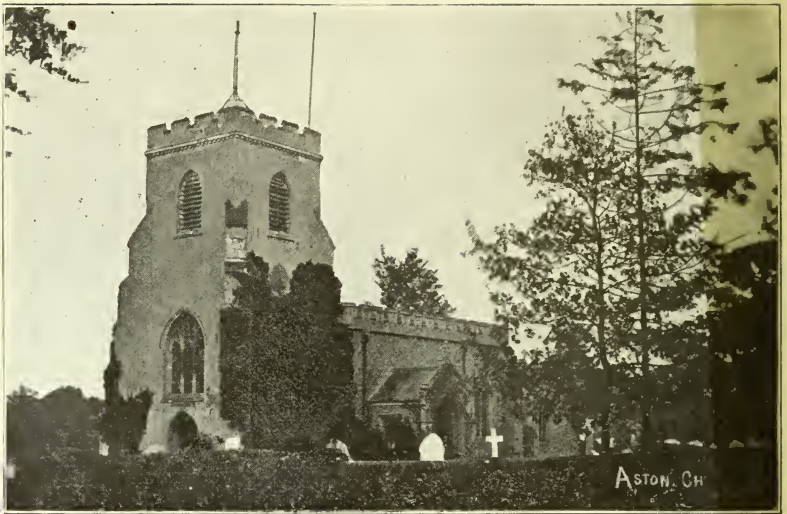
ASTON PARISH CHURCH, HERTFORDSHIRE, ENGLAND