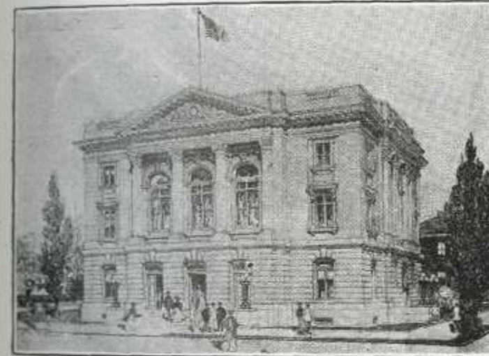
FEDERAL BUILDING, OGDEN, UTAH

Hill County Jail. Glasscock County Jail. Morris County Jail. Arizona Capitol. Ogden Post Office