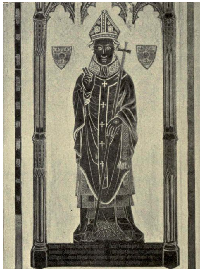
Brass in the ante-chapel of New College Chapel of Thomas Cranley, Warden and subsequently Archbishop of Dublin, died 1417, in archiepiscopal vestments with mitre and cross; the inscription is eight Latin verses, there are two shields; the marginal inscription, also in eight Latin verses, is nearly all lost. 50